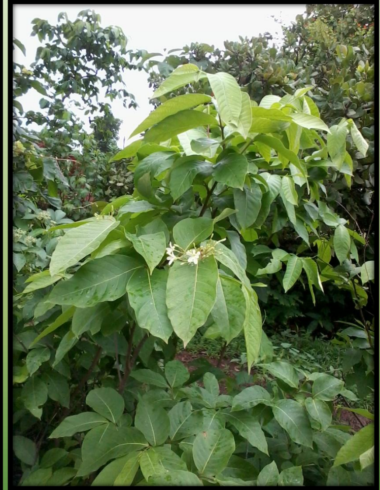
Pandra kuda - Apocynaceae family; ( Holarrhena pubescens )